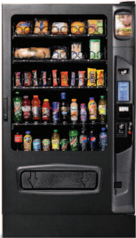
Shown in black with iCart touch screen and kick panel options.