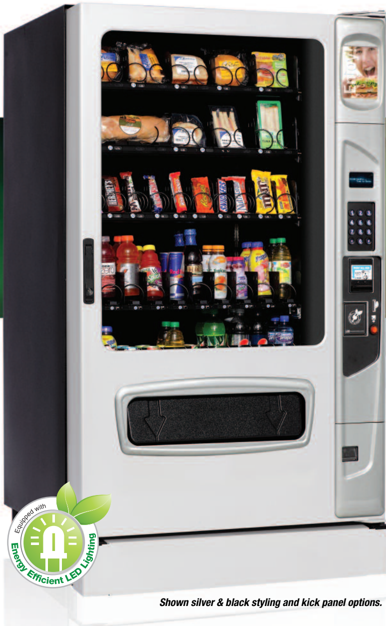
Shown silver & black styling and kick panel options.

The Alpine ST5000 glass front refrigerated food & beverage merchandiser provides the largest dispensing capability with class leading energy efficiency. Vend sodas, juices, milk, yogurts, and other foods best served cold from one versatile package.