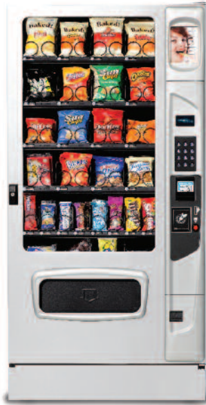
M4000 Shown with silver door color & kick panel options.