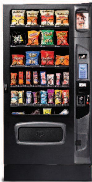
M4000 Shown with iCart touch screen & kick panel options.