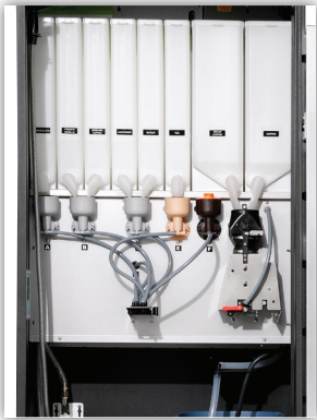
State-Of-The-Art Brewing System Simple brewing system and filtering ensure a high quality, consistent drink (No Filter Paper Required)